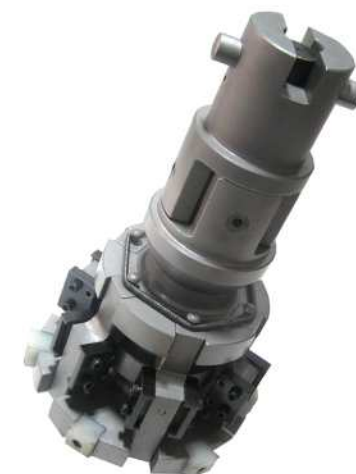
Curv honing tool

We offer all types of honing tools that are specially designed for high precision and cost-effectiveness.