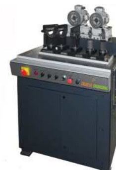
Resharpener multi head

We offer perfectly designed best quality gun-drilling and regrinding machines at reasonable prizes. Our gun drilling machines are well- recognised for their good accuracy and high precision.