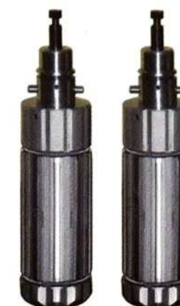
Inprocess gauging tool