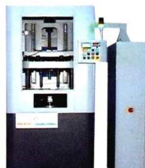
PSV - 600