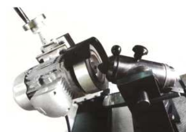
Resharpener single head