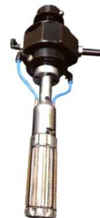
Inprocess gauging tool with air distributor

We offer sizing solution on all types of existing honing machines also.