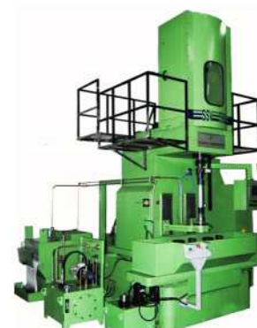
SSV - 550